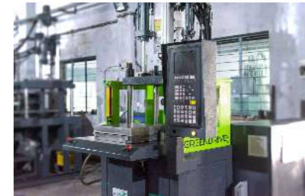
SINGLE SLIDER TYPE VERTICAL INJECTION MOULDING MACHINE MODELS